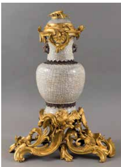
Fontaine à Parfum Louis XIV, Versailles, Musée National des Châteaux de Versailles et de Trianon

porcelain vessels with the coat of arms of Louis XV, but not in the shape and for the purpose one would expect.