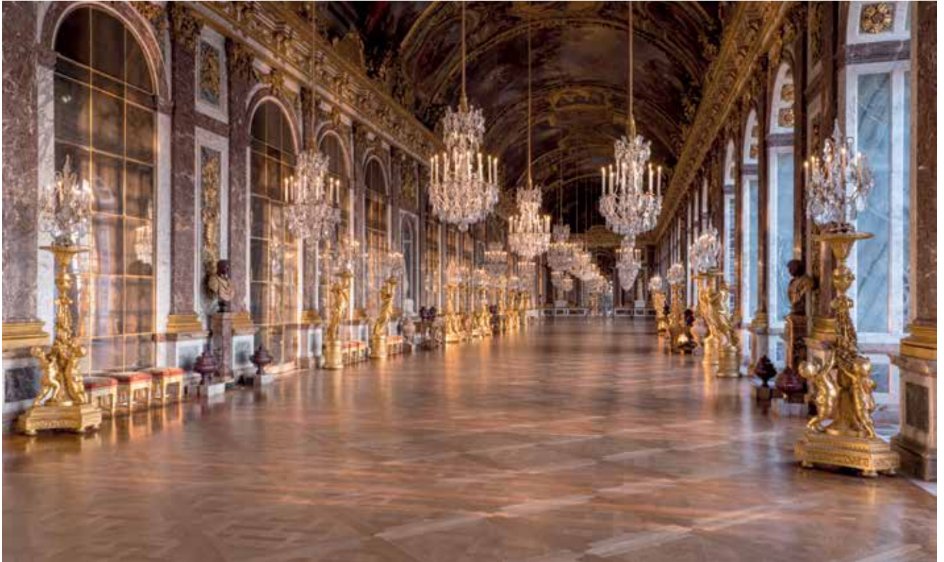
The Hall of Mirrors of the Palace of Versailles

When Chinese porcelain reached Europe, it fascinated the rulers and aristocrats because the material itself was unknown and the porcelain pieces extremely hard to procure. The first recorded piece of porcelain to have reached Europe in the 14 th century is believed to be the Fonthill Vase. According to Michèle Pirazzoli-T'Serstevens, ( La céramique chinoise en Italie, XIIIe-début du XIVesiècle , p78) it was presented in 1381 as a gift by the king of Hungary to the king of Naples and was later recorded as part of the collection of the Grand Dauphin, the son of Louis XIV. The Grand Dauphin was an avid collector of porcelain as were many members of the royal family. The inventory of Louis XIV (king of France from 1643 to 1715) was over 3,000 pieces, mostly Chinese. The king would drink his broth from a large Chinese porcelain cup with golden handles. But was Louis XIV a porcelain lover? Not really... when the court moved to Versailles in 1682, the flamboyant, 700-plus room royal residence, most of his porcelain collection ended up in storage. He was a politician and a businessman above all.