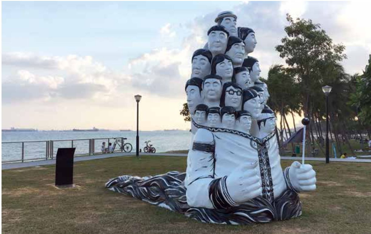
Crossing Shores