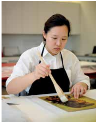
A paper conservator surface-cleans an artwork with a soft brush

Common treatments include surface cleaning, stabilising friable surfaces by consolidating with a suitable adhesive, repair and adhesion of broken parts for safe handling or gap-filling areas of loss. The scale of treatment depends on the needs of the artefact and its future purpose. For example, surface cleaning can be very straightforward and quick (as in removing dust and dirt from a small stable artefact with a vacuum and brush), but also complicated and time-consuming (as in removing hard and crusty dirt from a large sculpture). The possibilities are endless, as every artefact is unique in its own way.