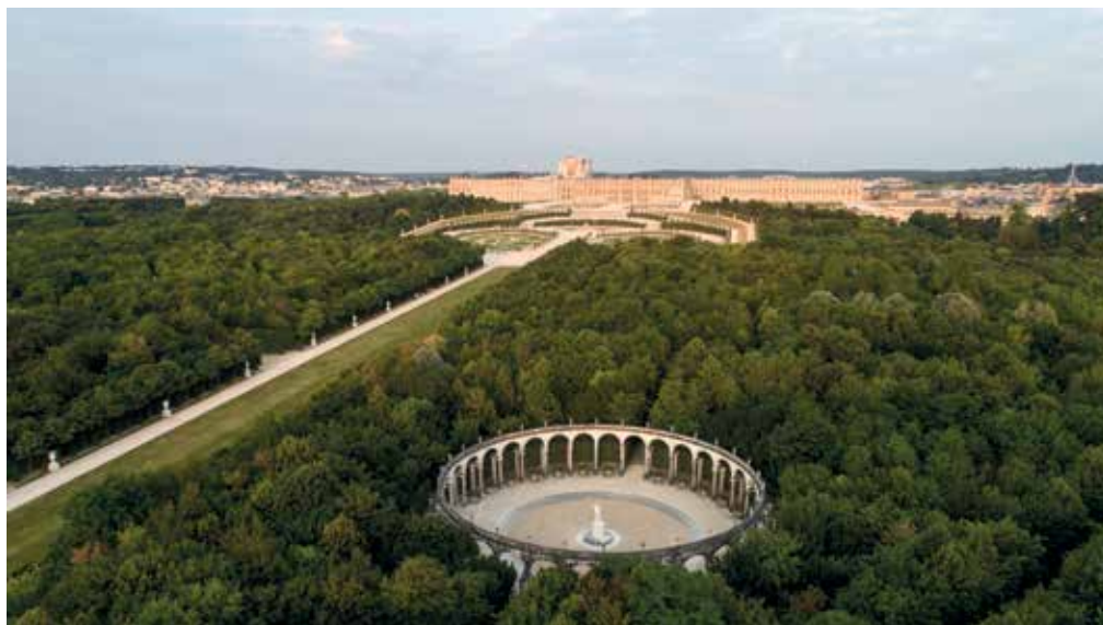
A view of the Palace of Versailles from the Petit Parc

This 'fashion' to display one's heraldry explains the abundance of armorial pieces from this period – many of them often fanciful and impossible to identify. Special orders were also made when guests of high rank were expected, as for example the recorded order in 1720 by Mademoiselle de Valois for the expected visit of the Princess of Modena (Queen Consort of England, Scotland and Ireland) to the castle of Nevers. This glazed earthenware set of faïence adorned with her coat of arms included, "two dozen plates, four bowls, two octagonal bowls, a large octagonal bowl, two pots with three octagonal plates, 12 chamber pots". The last item, an armorial chamber pot, may sound like the odd one out, but it was not an uncommon request at the time. While the Compagnie des Indes Orientales was under the governance of Louis XIV and later Louis XV, neither of them had private orders fulfilled by the Compagnie des Indes Orientales , but for one exception – made to order armorial