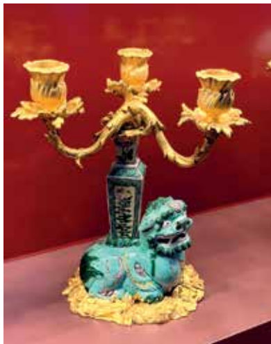
Candleholder, Qing dynasty, Kangxi period (1662-1720), Mounts: Paris, early 18 th century

The Wittelsbacher collection is particularly famous for its 'assembled' objects. These porcelain objects from China were made even more valuable by having them mounted on bronze or silver steeds. You might remember that one of the central objects in the special exhibition China Mania