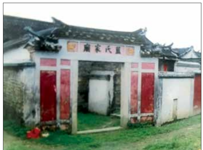
The family temple of the Xi An Gong (Gen 13) a sub-branch of the Fifth Branch