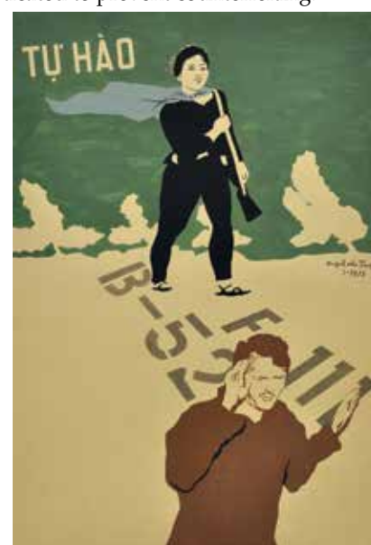
Huynh Van Thuan, Proud , 1973. Mixed Media Hand-Painted Poster on Paper

Complementing these artworks are excerpts from poems and memoirs written during or after the wars. The inclusion of text juxtaposed with image, shows the concerns of the artists and writers of the time. This quote from another resistance artist captures the conflict faced by many artists and writers who were conscripted into the war: "Here lies the principal point, the torment of my soul: how to make the self that serves the nation and the masses, and the self that serves art – the artists of course cannot forget this responsibility – not to come into conflict or, even worse, betray one another".