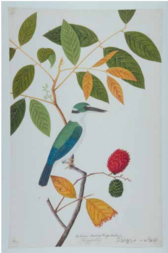
Drawing of a kingfisher, William Farquhar Collection of Natural History Drawings, early 18 th century, courtesy of the National Museum of Singapore

There are more than 90 species of kingfisher birds to be found around the world. Known for their spectacular hunting style and often bright and colourful plumage, they vary in size from the four-inch-long African dwarf kingfisher ( Ceyx lecontei ) to the 18-inch-long Australian laughing kookabura ( Dacelo novaeguineae ). Chinese craftsmen used the blue feathers of the common kingfisher ( Alcedo atthis ), the white throated kingfisher ( Halcyon smyrnensis ) and the oriental dwarf kingfisher ( Ceyx erithaca ). Historical documents report that kingfisher birds and feathers were brought to China as import goods and tributes from what are today South China, Thailand, Vietnam, Cambodia and Sri Lanka. The Chinese preferred the feathers that came from Cambodia since they were of the highest quality and featured the most striking blue hues, from ultramarine to turquoise. The high value of kingfisher feathers derives from the very fact that they were hard to obtain since the tiny birds could not be bred and were hard