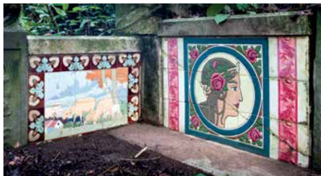
Farmyard scene and portrait tile panels

Admired for their charming floral motifs and cheerful colours, vintage tiles in Singapore are more than the beautiful imports of the industrial era. Dragons and dainty fairies forever captured in time are a mosaic of traditional Chinese culture, foreign influences and local trends. The rich diversity of motifs found here tells a fascinating story of Singapore's complex cultural DNA and the nation's ability to reinterpret overseas elements to suit home-grown customs.