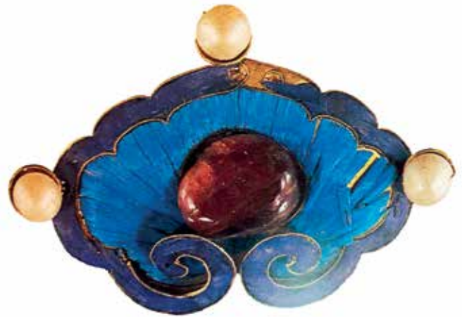
An example of a Qing Dynasty period brooch made of gilt, pearls and kingfisher feathers. From the Forbidden City collection of concubines' jewellery.

the beautiful headdress dating to the 18 th century in the ACM collection shows.