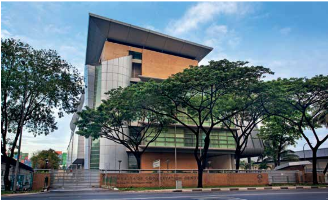
The Heritage Conservation Centre (HCC)

Tucked away in the west of Singapore, the Heritage Conservation Centre (HCC) of the National Heritage Board is home to Singapore's National Collection of at least 200,000 artefacts and artworks of various mediums.