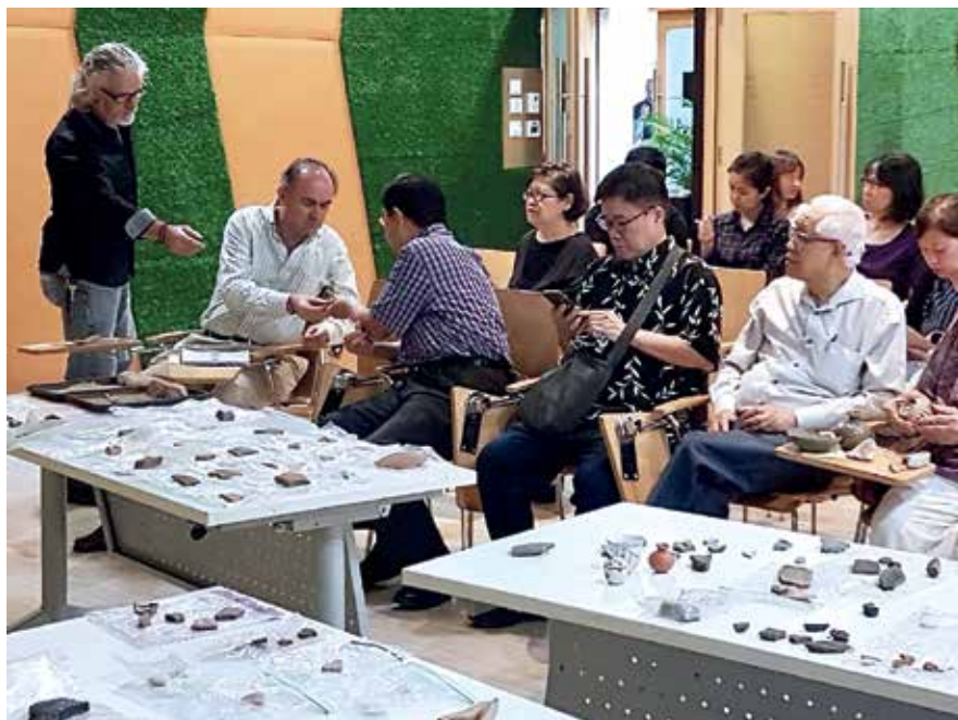
The author (left) leading a shard workshop, organised by the Southeast Asian Ceramic Society (SEACS).

We also need to think of the other things recovered with shards. At Koh Ker (a 10 th century rogue-like Angkorian capital in Cambodia) in a site adjacent to the royal palace, for example, we find a lot of cooking pots. Cooking pots are not unusual in a household site. However, the volume in this case is unusual. Why so many? There are other large