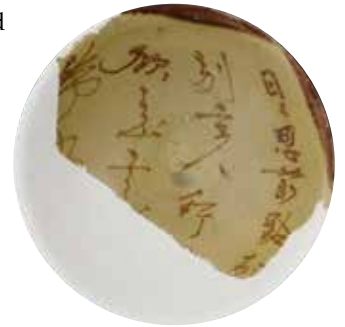
A reconstructed Changsha bowl where the added material can be clearly distinguished from original material. The characters on the bowl are not recreated due to lack of information and evidence. Artefact featured is from the Asian Civilisations Museum's Tang Cargo Shipwreck Collection.

While both preventive and interventive conservation are important, more emphasis has to be placed on the former. Conservation treatment is necessary but also costly and time-consuming. With a huge collection and limited resources, in the long term we can contribute more to the collection's preservation by having proper guidelines and appropriate environmental conditions.