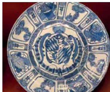
China, Ming dynasty, Wanli period (1573-1919) circa 1600. Armorial porcelain plate with Wittelsbach coat of arms

One of the oldest pieces in the collection is from the 16 th century. It was a commissioned plate in the classical colours of blue and white, which also happened to be the colours of Bavaria. The Bavarian coat of arms is depicted in the middle of the plate. This was a speciality of the Chinese, the production of porcelain that was custom-made for