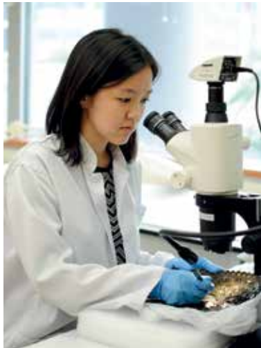
Stereo microscopes are used to magnify features that cannot be seen with the naked eye

First, the conservator investigates an artefact's provenance, significance, structure, materials and condition through the study of literature, past conservation documentation and visual and scientific examination of the artefact. Scientific equipment is useful in revealing details that are not visible to the naked eye. For example, stereo microscopes are used to study features under magnification, X-Ray Fluorescence (XRF) analysis provides information about a material's elemental composition, and X-radiography can reveal features that are not visible on the surface. The conservator also assesses the condition of the artefacts in their present state, identifying features of deterioration, damage and past repairs. The information gathered in this phase is important for informing decisions made during conservation treatment.