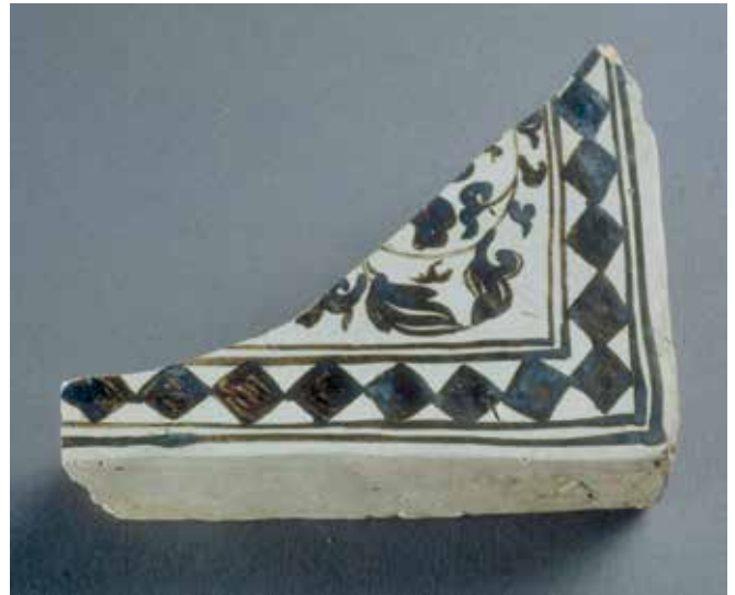
Shard of a made-in-Thailand tile found in Java

Of critical importance, if you really want shards to ‘talk’ to you and tell you their story, is asking relevant, answerable