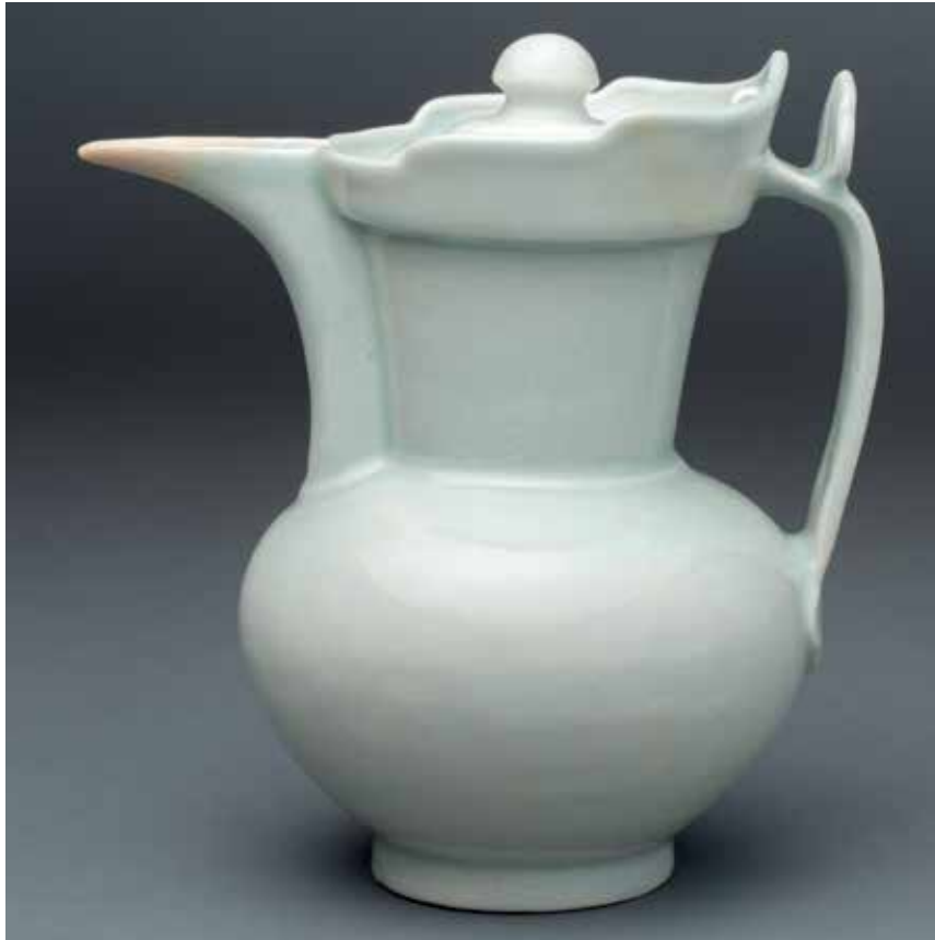
White porcelain monk's cap ewer made in Jingdezhen, early 15 th century

The gentle and subdued glassy reflection of the ewer comes from a glaze called tianbai (sweet white) because it looks like melted white sugar. Under its smooth glaze, the object is decorated with various motifs. When it is brought into the light, graceful designs such as lotus scrolls, roundels and ruyi (fungus or sceptre, with the auspicious meaning of 'according to your wish') appear. Don't get frustrated if you can't see them because they are meant to be subtle and discreet. This type of decoration is called anhua (secret or hidden decorations) by ceramic connoisseurs. Designs are