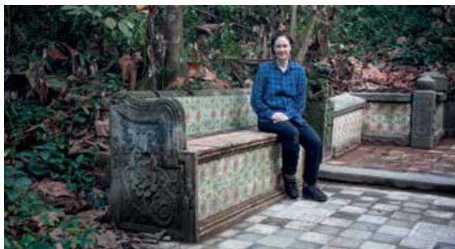
Rare twin-tiled bench tomb