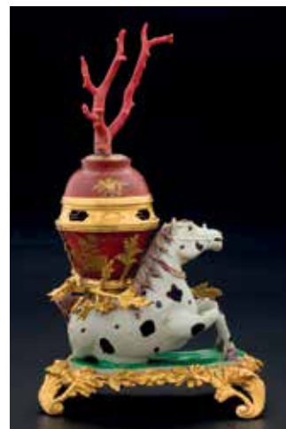
Mounted incense burner, porcelain: China, Jiangxi province, Jingdezhen, Kangxi period (1662-1722); European gilt-bronze and Japanese lacquer: second half 18 th century