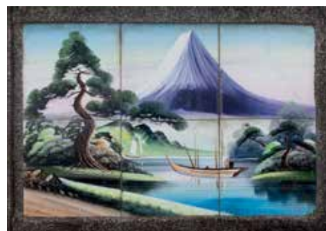
Japanese mountain landscape tile panel

Some 100 volunteers ended up cleaning nearly 2,000 individual tiles over a five-month period. The most memorable cleaning session was of a rare twin-tiled bench