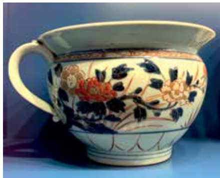
Japanese Imari chamber pot 1680-1720

To my amazement, I discovered that during the 17 th and 18 th centuries the Wittelsbachs had collected one of the most splendid collections of Chinese and Japanese porcelain I have ever seen. You might recall that Europe only discovered the secret of porcelain-making in 1708 in Dresden, so owning a collection like this not only showed the family's wealth, but also the sophistication of the collectors. The pieces were often displayed in specifically built 'Mirror Cabinets' to showcase their 'special' nature and quite often it didn't matter that no one actually understood the meaning of the artefacts. For the Chinese, every motif had a meaning while the Europeans very often