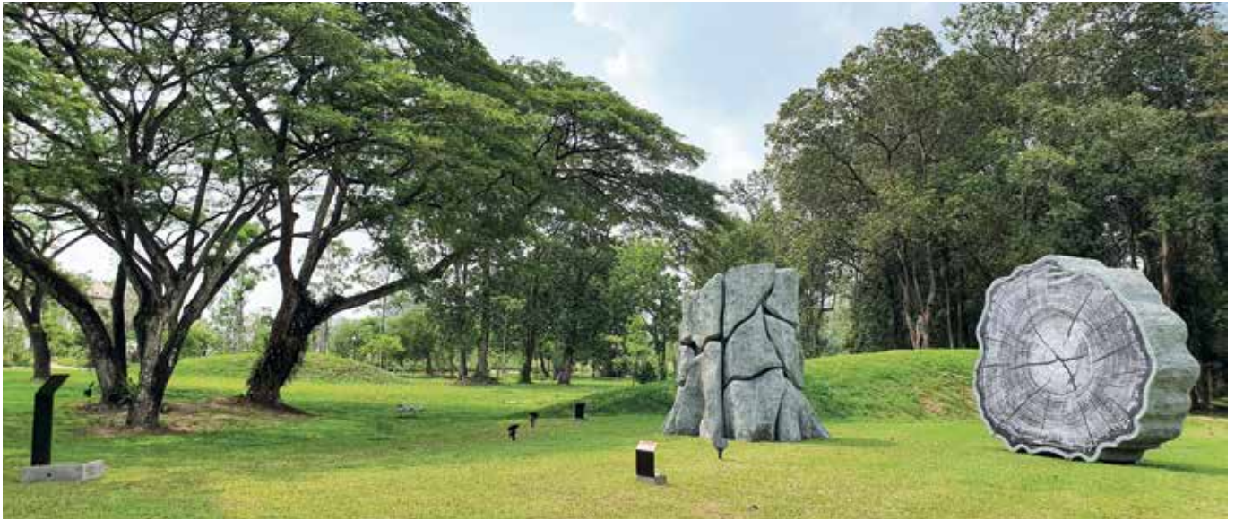
The Time Tree by day, photo courtesy of the National Arts Council

he expects others to do the same. When Speak Cryptic was posed this question, "If Crossing Shores could talk, what would it say?" His reply was, "I hope when you see me, you see me more like a mirror. I am a reflection of you and you are a reflection of me."