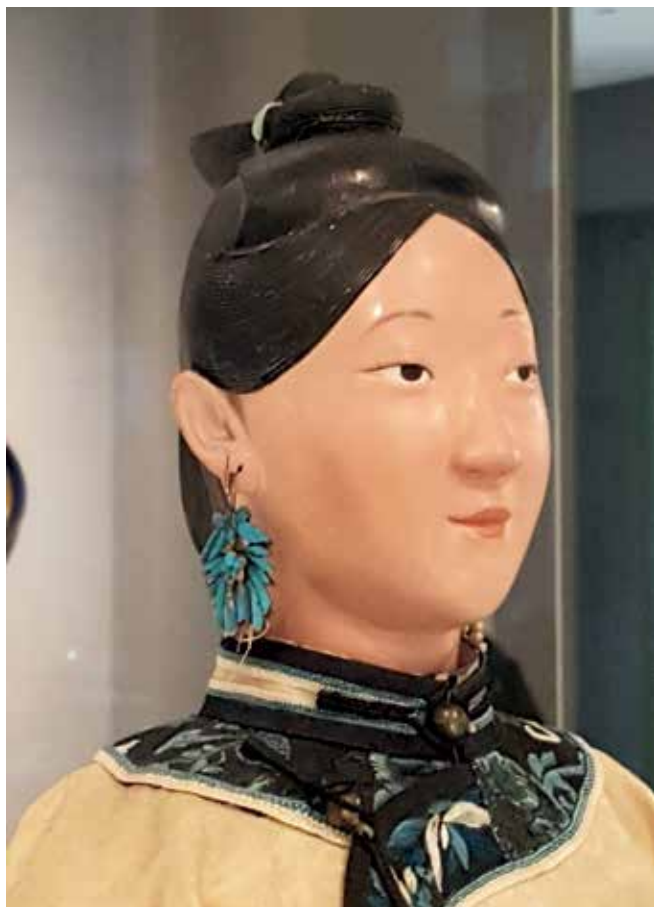
Top image, a pottery mannequin of a Chinese lady. Bottom image, a close-up of her head showing the kingfisher feather earring, collection of the Asian Civilisations Museum

Currently, only the two female Chinese nodding head dolls in the Trade Gallery of ACM wear jewellery with kingfisher inlay. You might mistake the adornments as enamel, but when you look closely you will see the beauty of the kingfisher. You might then want to remember the lines in the Ballad of the Beautiful Ladies written by the famous poet Du Fu (712–770), "On their heads, what do they wear? Kingfisher glinting from hairpins that dangle by side lock borders."