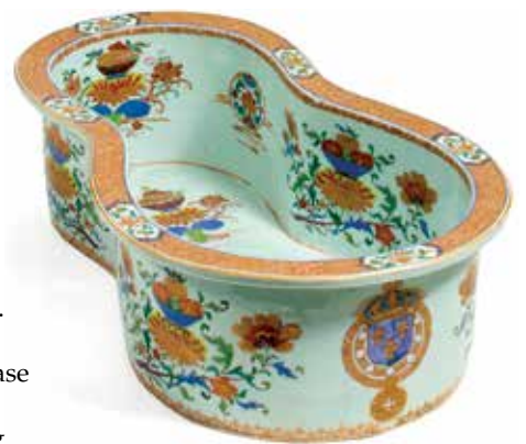
French royal armorial porcelain bidet

Among the pieces in high demand in France at the time were armorial ones, either in porcelain from China or local, glazed earthenware known as faïence from French manufacturers. The 'passion' for armorial plates was directly