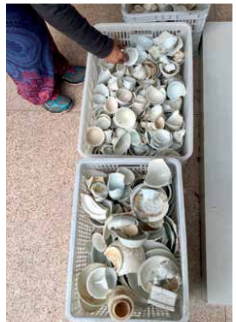
Basket of shards from the Dehua kilns of China, photo courtesy of Patricia Bjaaland Welch

So how does one analyse shards? At first, most people try to imagine the shard in its complete form like a puzzle piece. With enough experience, handling and good reference collections, this is easy to