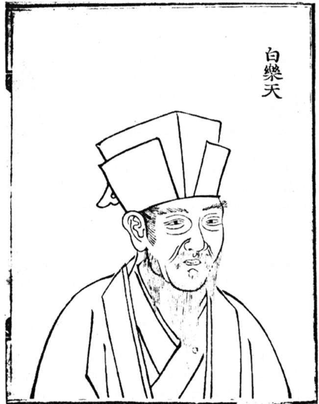
Portrait of Bai Juyi

Then in 751, China lost a major battle on its western frontier, one that enabled the Tarim Basin to fall back into Tibetan hands from which it had been won in 738. The 'Battle of Talas' weakened China's military at the same time as it was fighting a rebellion in China's southwest regions and a famine was sweeping the country. Du Fu, having failed the imperial examinations for the second time, was struggling home wracked with grief at the excesses he had seen in the capital and the plight of the peasantry, whose sons were now being conscripted for military service, when he wrote: