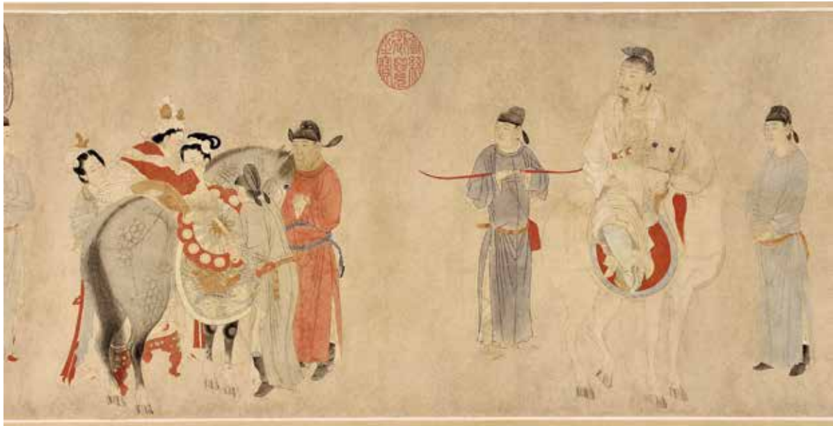
Yang Guifei Mounting a Horse, by the Song Dynasty/Yuan Dynasty artist Qian Xuan (1235-1305 CE).

The emperor and Yang Guifei, accompanied by some members of the court and the Yang clan, fled south, only to be halted en route to Shu (Sichuan Province) when the troops demanded Yang Guifei's and her powerful second cousin's death. The scene is recorded in Bai Juyi's famous poem, Everlasting Remorse :