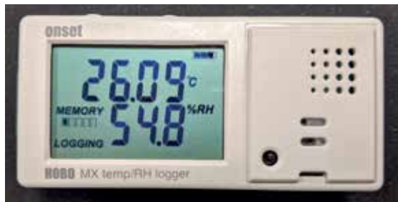
Relative humidity and temperature data loggers monitor the environmental conditions that artefacts are exposed to

Preventive conservation is the practice of delaying deterioration and reducing damage to cultural heritage through the provision of stable environmental conditions. It is the first line of defence in prolonging the life of an artefact. Everyone who interacts with artefacts contributes in some ways to preventive conservation efforts.