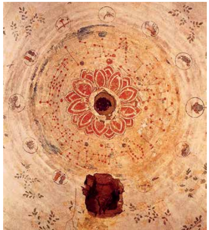
Star chart painted on the ceiling of a Liao Tomb (ca 10 th century).

The Yellow Emperor, Huangdi, is said to have invented the Chinese calendar and Sexagenary Cycle in either 2697 or 2637 BCE, although it is unclear whether Huangdi existed. Inscriptions on oracle bones from the late Shang dynasty indicate that a form of the Chinese calendar with leap months was used in the 13 th century BCE. While the timing of its origin may be unclear, the Chinese calendar (despite some 100 reforms to tweak its accuracy) continued in use as China's civil calendar until 1912, when the fledgling Republic of China initially adopted the Gregorian calendar. In the late 1920s, the republic's Nationalist government took steps to ban the use of the Chinese calendar for civil purposes, yet effectively continued the use of reign years, declaring 1912 to be the first year of the Minguo era. The Communist Party of China ended this practice in 1949, when it both retained use of the Gregorian calendar and did away with the Minguo era, recognising the year as 1949.