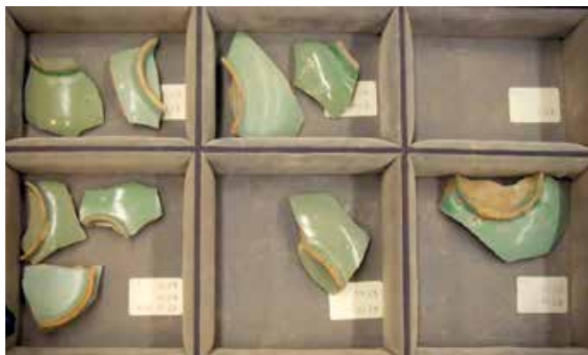
Shards of one of China's most famous ceramics - ruware.

Thus, I leave you with many questions. The challenge – what other questions can you consider and how will pot shards help? I've been doing archaeology and pottery analysis for 30 years, but I find non-archaeologists also have a lot to offer archaeologists through their questions. No question is dumb. Just ask. Also, ask your friends and have them ask you, the next time you visit a museum.