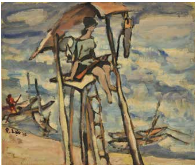
Pham Luc, Untitled (A Female Guerrilla) 1970. Watercolour and Pencil on Paper

Pham Luc, trained at the Hanoi College of Fine Arts and upon finishing his studies, joined the People's Army as a frontline painter in 1965. He worked for the military art department for 35 years, training young artists before retiring in 2000. Over the years he worked in a variety of mediums and styles; the collection features artworks in watercolour ( Untitled (A Female Guerrilla) , 1970), Chinese ink ( Untitled (Hoan Kiem Lakeside, Hanoi) , 1992) as well as lacquer. His work is marked by strong emotions depicted through the use of bold brushstrokes and vibrant colours. Luc often painted women and children in the war because he felt that they were the most affected by the conflict.