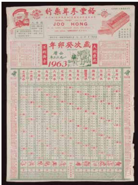
Chinese calendar featuring twelve zodiacs, published by Joo Hong Medical Hall.

the critical structure guiding China's agricultural society and are enrolled in UNESCO's List of the Intangible Cultural Heritage of Humanity.