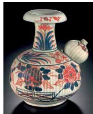
Imari Kendi, Japan, for the Malay export market, late 17 th century

export and often called armorial porcelain. The ACM houses some fine examples.