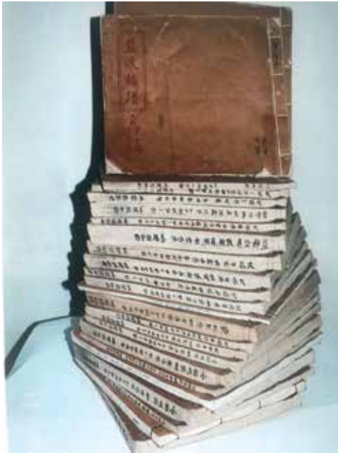
The ninth edition of the DLG compiled in 1932

The 10 volumes I found, the Dabu Lam Clan Genealogical Tables (DLG), told the story of 800-900 years of Lams who lived in the heart of Hakka country in Dabu County, Guangdong Province. (The most well-known Singaporeans with Dabu lineage are Lee Kuan Yew and Lee Hsien Loong.)