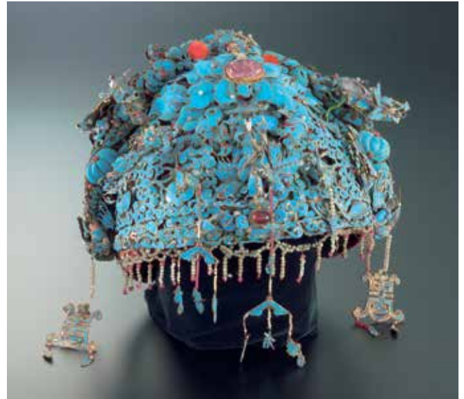
Headdress with dragons, phoenixes, female figures and auspicious characters such as shou (long life), and also kingfisher feathers, augmented with gems and pearls, 18 th century, courtesy of the Asian Civilisations Museum

to catch. The trade in highly prized kingfisher feathers was therefore a major contributor to the wealth of the Khmer empire and played a significant role in the construction of many temples near Siem Reap.