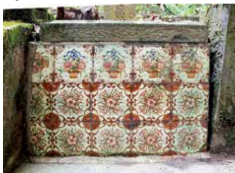
Rare transfer tiles of flower basket

Initially attracted to elegant tiles seen on some heritage shophouses, I began taking a more serious interest when I discovered similar tiles at sites connected to my ancestors.