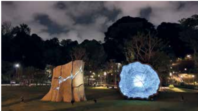
At night, The Time Tree lights up from within, highlighting its cracks and gaps, creating an aura of mystery and a sense of the unknown.

Set against the backdrop of the ocean in East Coast Park, Crossing Shores will be located by the Siglap Canal, East Coast Park (about five minutes walk from Carpark D1) until February 2020.