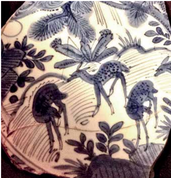
A kraak shard

We think of ceramics as being functional – pots, plates, bowls; or as decorative, cultural, religious or prestige items – such as incense burners, vases, urns, burial jars, mosaics, statues, imperial ware, etc. Ceramics are also pieces of art, expressing many things from myths and stories to political statements. We also assign values to well-made and ancient pottery, like any other form of art or antique. Value is mostly based on rareness, age, ownership, authorship (creator), cultural affiliation, craftsmanship and other aesthetic properties. But are these the most salient characteristics? Are they the most important considerations for archaeologists and archaeological questions?